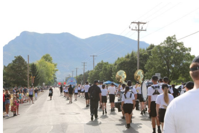
Highland Fling Fun Run

Thank you to all the residents for making Highland a great place to live!