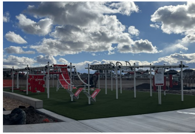
Highland Family Park Ninja Course

The city also started a new park maintenance building by the Community Center off Alpine Highway and a new irrigation pump house on 6000 West. The city also purchased property by City Hall, which secures the property a culinary water pump sits on and a possible future park (Dog Park?). With the new subdivision on 6400 West (Foxwood Estates), the city approved plans to connect the City Center trail to the Murdock Trail, the fruition of a long-anticipated connection.