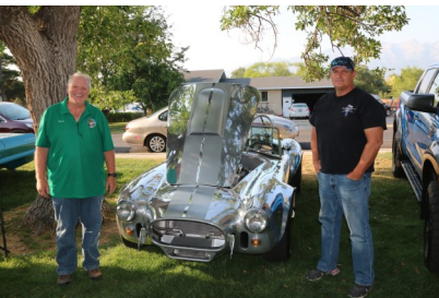
Car show at the Highland Fling

On the development side, several subdivisions were approved, some of the larger developments being Williams View, Foxwood Estates, and Magnolia Estates, all following current R-1-40 zoning. Ridgeview development by Lone Peak High School has finished several phases. The city approved its first alcohol license for the new Little India restaurant. The large commercial development of Highland Mains (Timp Hwy / Alpine Hwy) received its final approved plans and anticipates starting in 2025.