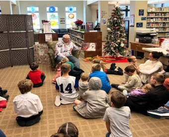
Reading a Christmas Story to the kids at our Highland City Library