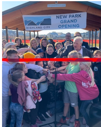
New Park Grand Opening