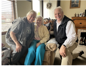
Delivering Meals on Wheels